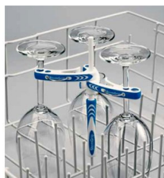
glasses upside down